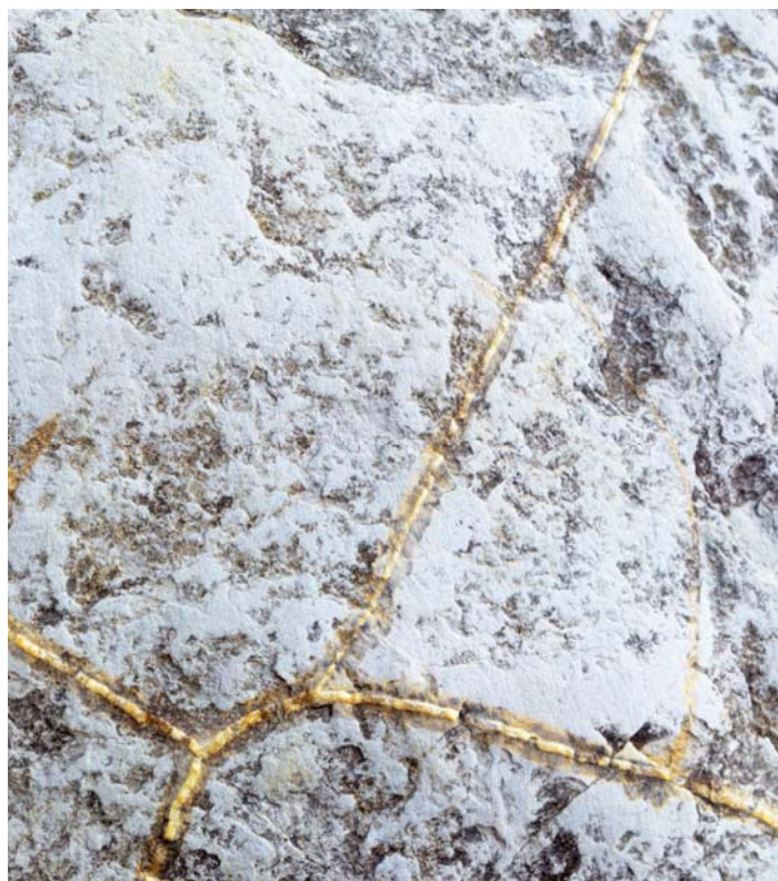
Image: Detail of the stone structure, Moeraki Boulder, Moeraki Beach, Hampden, Otago Region, NZ.